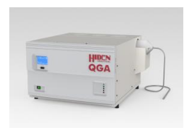
Hiden QGA quantitative gas analysis system

Detection of CO in N<sub>2</sub> is of importance in many application areas: