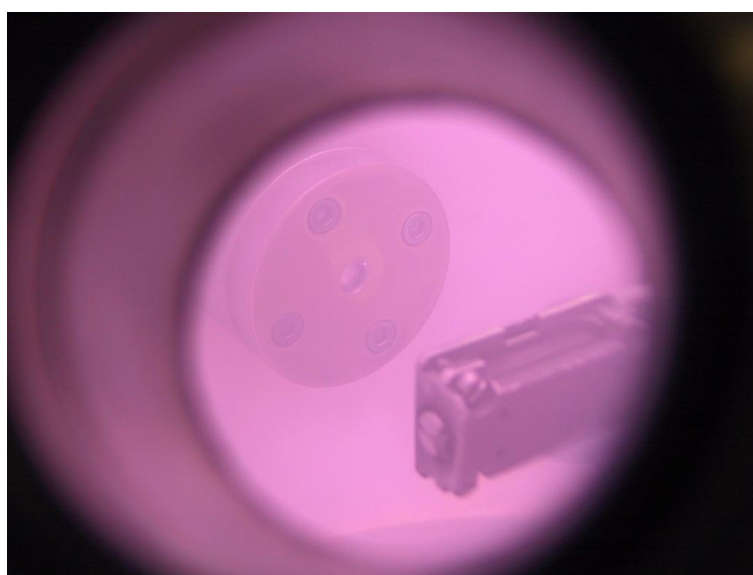
Figure 1. The sample holder facing the EQP 300 mass spectrometer nozzle

Negative ions in low-pressure plasma sources are created either in the plasma volume by dissociative attachment or, at the plasma surface interaction due to surface ionization of backscattered or sputtered particles. Negative-ions formed on surfaces are accelerated towards the plasma by the sheath. They can influence the plasma kinetics through collisions with plasma species, or are self-extracted from the plasma thanks to the energy acquired in the sheath. Self-extraction of negative-ions can affect processes like sputtering, where the negative-ions formed on the cathode bombard the layer being deposited. In applications such as negative-ion sources for accelerator or fusion devices, it is taken advantage of negative-ion surface production. A low work-function material (usually caesium-covered metals) is in contact with the plasma and greatly enhances negative-ion production because of the low energy required to extract an electron from the surface. However, caesium free negative-ion sources would be greatly valuable for fusion applications because of the strong maintenance constraints induced by caesium injection.