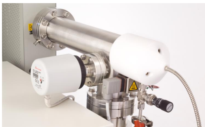
HPR-20 QIC TMS Transient MS

The Transient system monitors gases and vapours with molecular weights to 300amu with higher mass ranges available for specialised applications, and systems include provision for import of two external process parameters, temperature and/or weight for example, for integration with the mass spectral data.