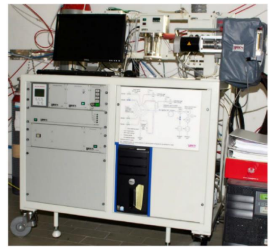
Figure 1: The Hiden Analytical System in the Lab

As an example, Figure 2 shows the result of a H<sub>2</sub>-TPR performed using a SiC monolith loaded with 15%wt of CuFe<sub>2</sub>O<sub>4</sub>.