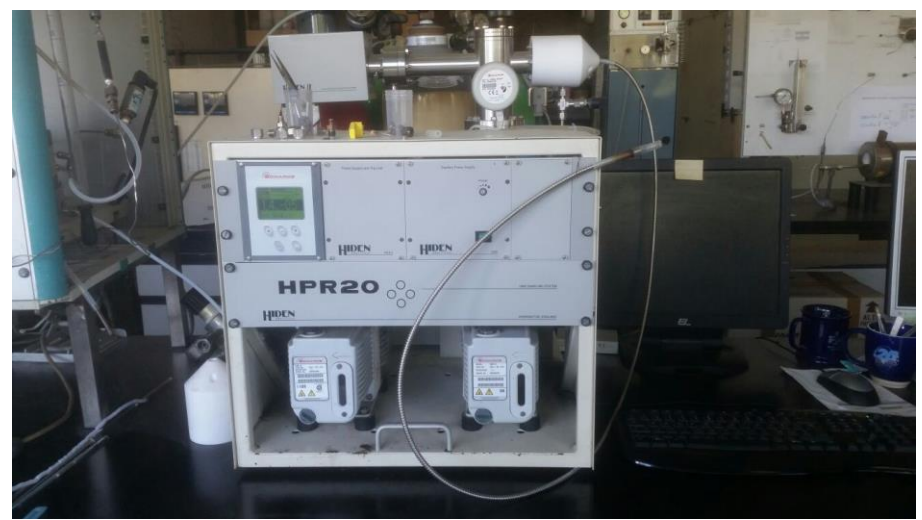
The Hiden HPR-20 EGA in the Lab used for characterisation and testing of catalytic samples

The use of a QMS allowed us to easily discriminate between the different species desorbing from our surfaces, without the use of any kind of chemical or physical filter and traps which could negatively affect our analyses. By properly tuning the ionization potential of our instrument, we were also able to avoid water molecule fragmentation and related interference with the ammonia m/z signal. The reliability and accuracy of the ATPD data were assessed by theoretical criteria and experimental tests highlighting the effects of carrier gas, data acquisition mode, catalyst particle size and reactor geometry, remarking the flexibility of the technique employed. All of the studied materials featured complex ATPD patterns spanned in the range 423-873K, except for ceria which showed a narrow and resolved desorption peak, indicative of homogeneous weak acidity. Quantitative data signalled a difference of more than one order of magnitude in ammonia uptake between silica and the other materials. Since the ATPD profiles of ceria match Gaussian curves regardless of heating rate and surface coverage, the patterns of the studied materials are described as linear combinations of four